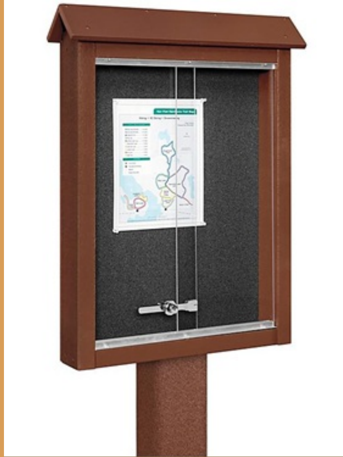
Example of what the neighborhood bulletin boards will look like