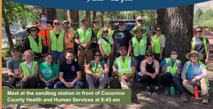
Meet at the sandbag station in front of Coconino County Health and Human Services at 8:45 am